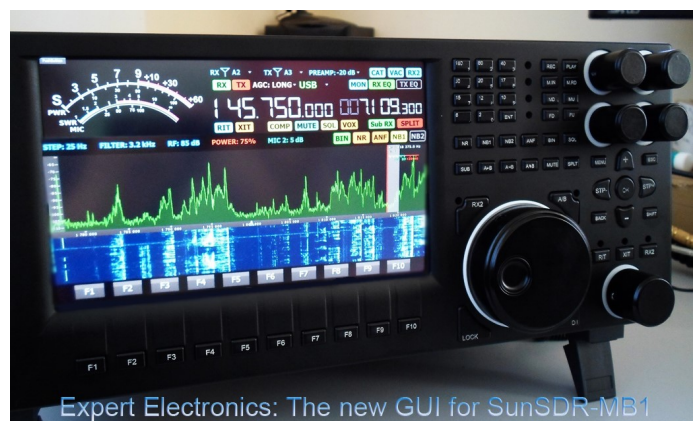
Expert Electronics: The new GUI for SunSDR-MB1

So don't let the low sunspots get you down, hop on the digital train!